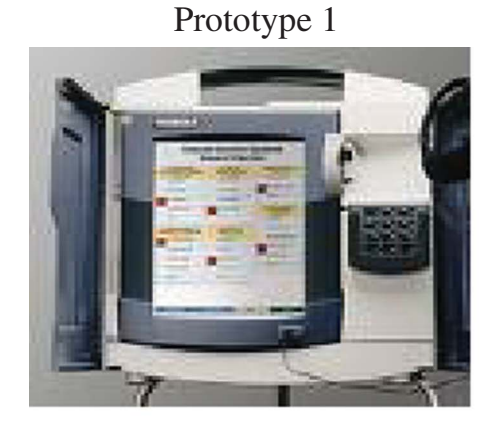
FIGURE 2. Prototypes tested in the Colombian e-voting pilot (color figure available online).